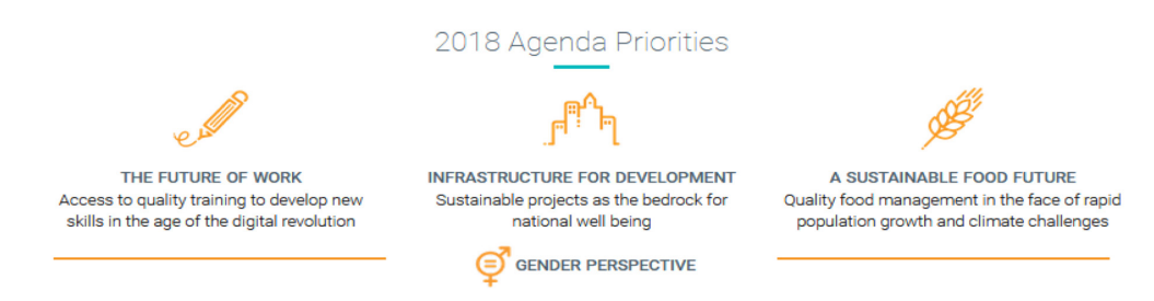
Figure 3: Priorities for the G20 Argentina