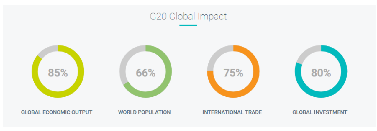
Figure 1: G20 Global Impact